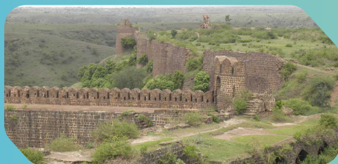
Dharur Fort (2 km)