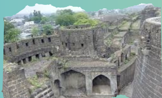
Naldurg Fort (90kms)