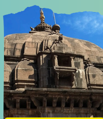
Parli Jotirling (45 kms)