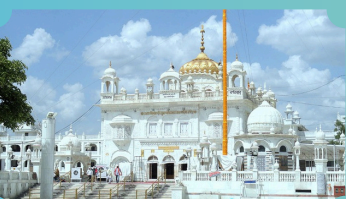
Gurdwara Nanded (170 kms)